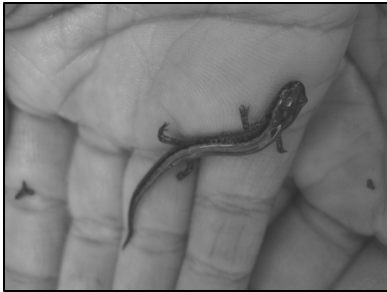
A salamander found while investigating one of CEC's wetlands.

Program Description: Your students, critters, water, and wetland soil- what a perfect combination for learning about our watershed! Your students will be divided into smaller groups to investigate one of the ponds or wetlands at CEC. We will complete pH and dissolved oxygen tests on the water and collect plants and critters to identify and classify. Once all the data is collected, each group will use their findings to determine the quality of their wetland or pond. Each group will report their findings to the other groups and compare and contrast results. Student are encouraged to bring extra shoes or water boots and wear appropriate clothing for wading into the shallow areas of the wetland or pond. A change of clothing is also a good idea...just in case! Students will not be allowed to go in above their knees.