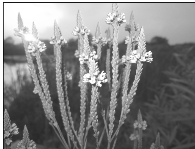
Flowers near our East Wetland

"Thank you for coming... I really liked learning about the animals you brought to my school... I also told my mom about you and the stuff that I learned. She was very impressed with what I told her..."