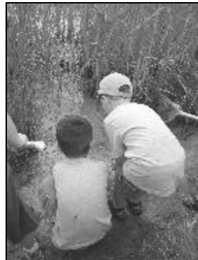
Students searching for pond life at Cope Environmental Center.